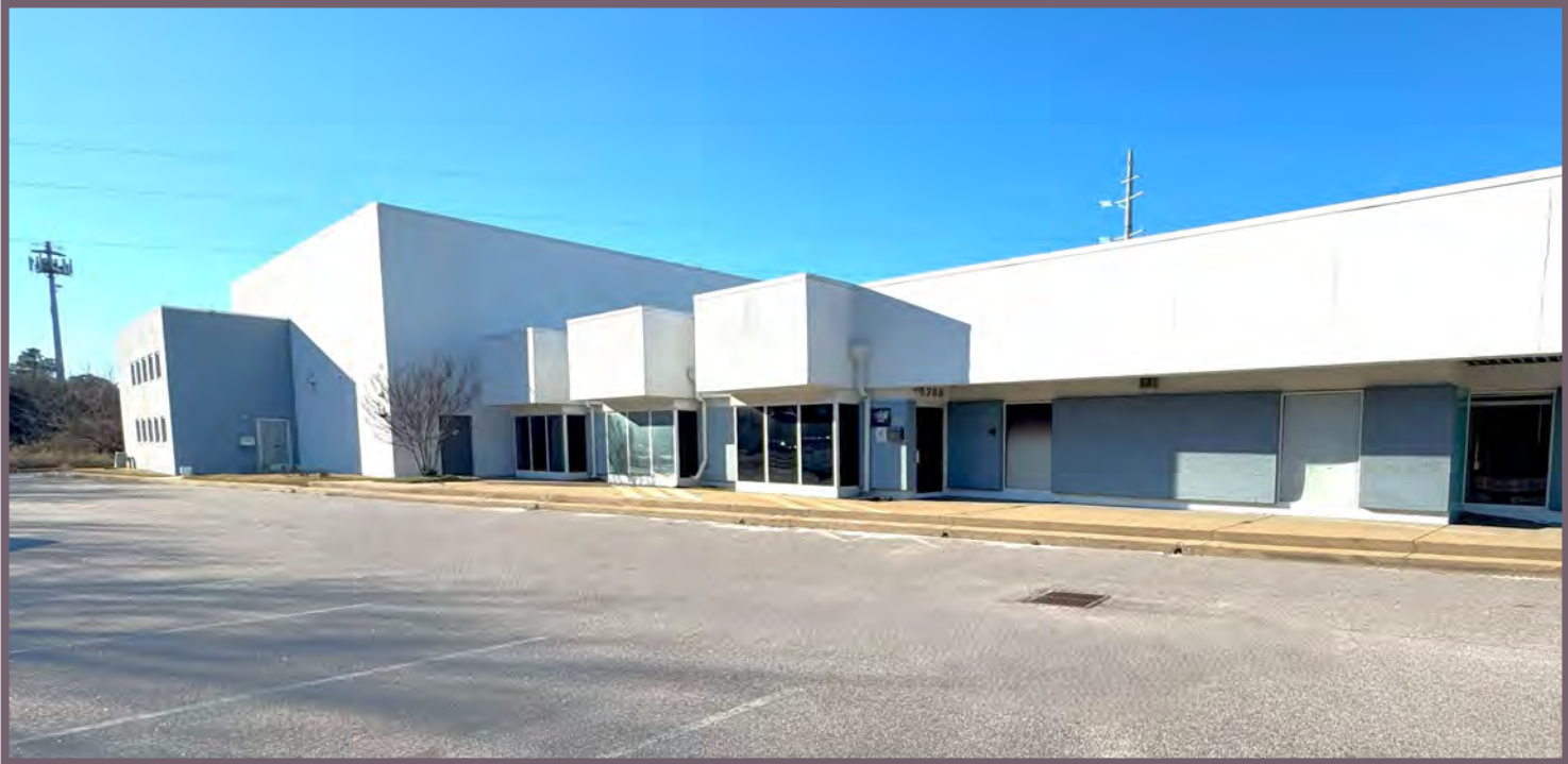
Ward Court Viewpoint