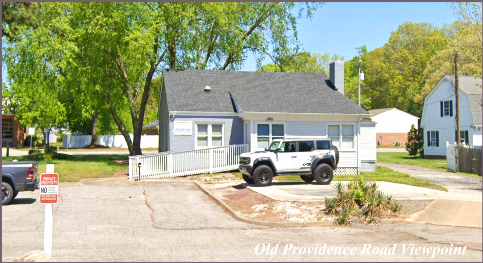
Old Providence Road Viewpoint