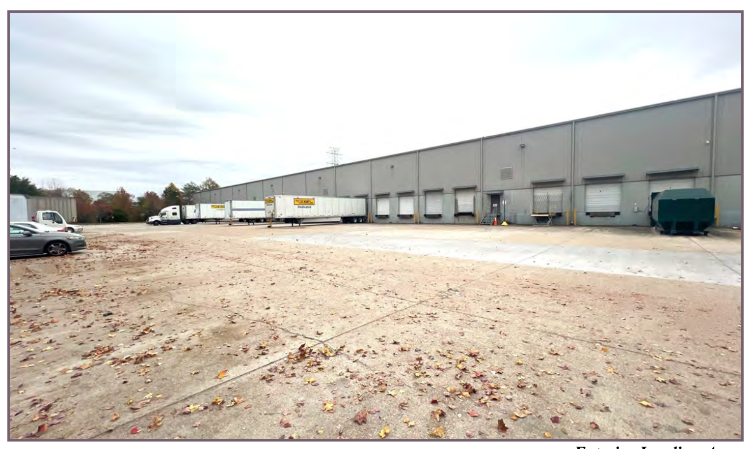
Exterior Loading Area